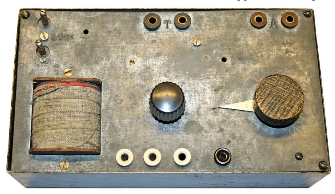
Kongshavn Country of origin: Norway