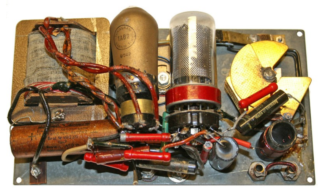
Internal view of Kongshavn variation 1. The valves were an ECH21 regenerative detector/AF amplifier and a TAB2 HT rectifier. Note the ubiquitous double tuning capacitor.